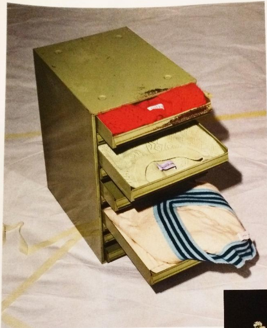
De haut en bas. Pull, Claudie Pierlot. Pull, Eric Bompard. Pull, Kujten. Caisson à tiroirs, Armandetcolette.fr